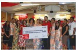
Volunteer Centre, Page 3