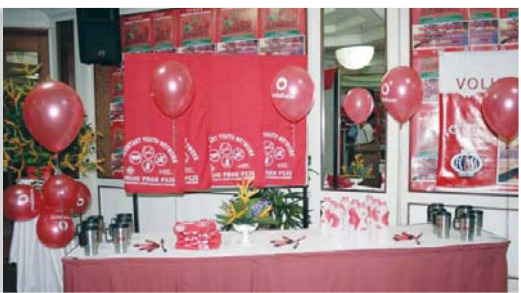
PALM products displaying drug & substance abuse messages

The rationale behind the establishment of the Voluntary Youth Network [VYN] was to provide young people with a platform to positively contribute to social development. The need for a youth network arose out of the folding up of the Fiji National Youth Council and lack of opportunity for youth and voluntary youth organizations to express themselves.