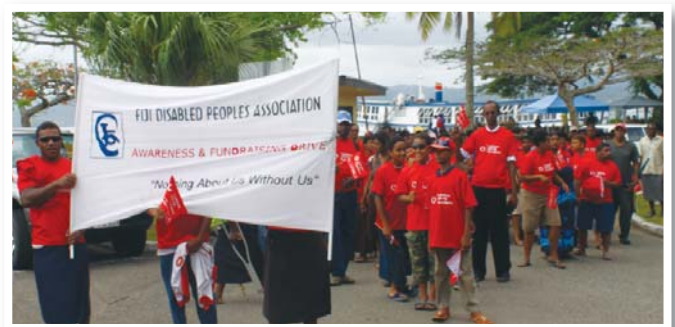
Nothing About Us Without Us ... disabled march through Suva City

"Parents who had brought their disabled children to the function could not hold back their emotions at the excitement the children showed. Overall there was an element of amazement by the spectators."