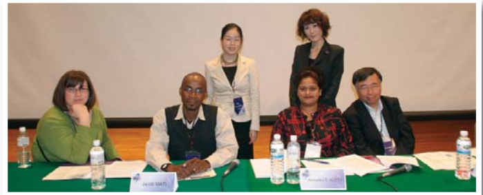
Ambalika with CSI panel presenters in Taiwan

The paper highlights the counter measures that help mitigate the CSO issues and concerns.