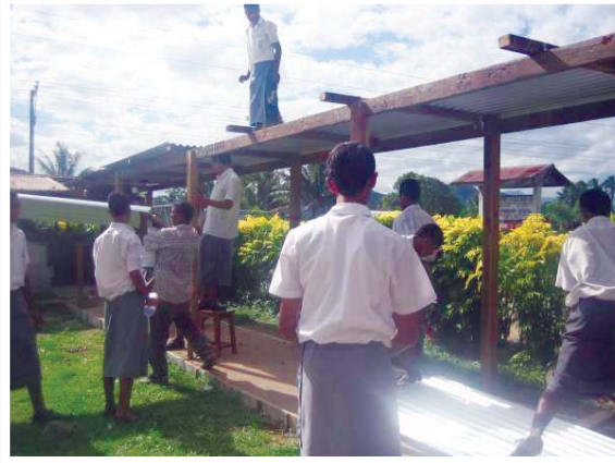
Walkway shelter at Rampur College in Navua

Drasa Secondary School: Agricultural Project - Boost agricultural activities for ongoing process for commercial purpose.