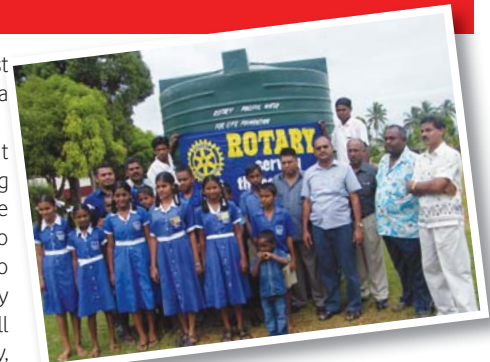
Water tank at Tabia Sanatan Primary School

No longer do I have to walk up and down that hill, I am getting older and my body is not as young and the thought of not climbing that hill anymore is such a relief. My children are now moving back to our home to help look after my husband and I and to help on the farm. Thank you for bringing my family together again!" For me this is what this project is all about "By helping the individual, we help the family, who help the community make our country a better place".