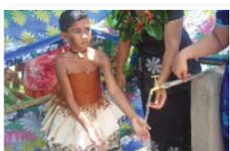
Water for Life, page 5