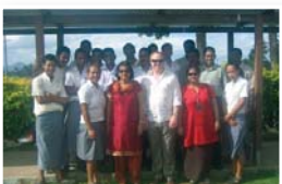
DEAP report, page 4