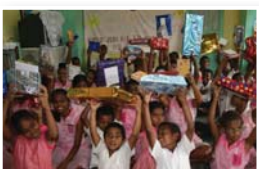
Xmas donations, page 6