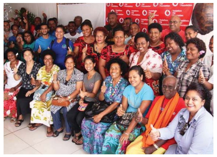
Stakeholder meeting in Labasa

"Our society is depressed with so many problems ranging from health,