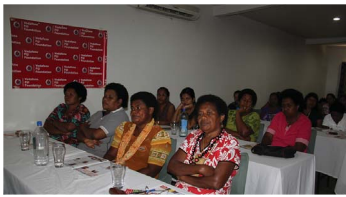
Participants at the mWomen symposium in Labasa

It is not only women who benefit from mWomen services. Fifty percent