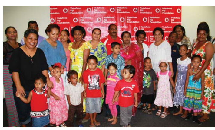
Receipients of the grant

The Wings of the Morning Ministry is a noble cause assisting children with orthopaedic conditions, burns, spinal cord injuries and cleft lip and palate conditions.