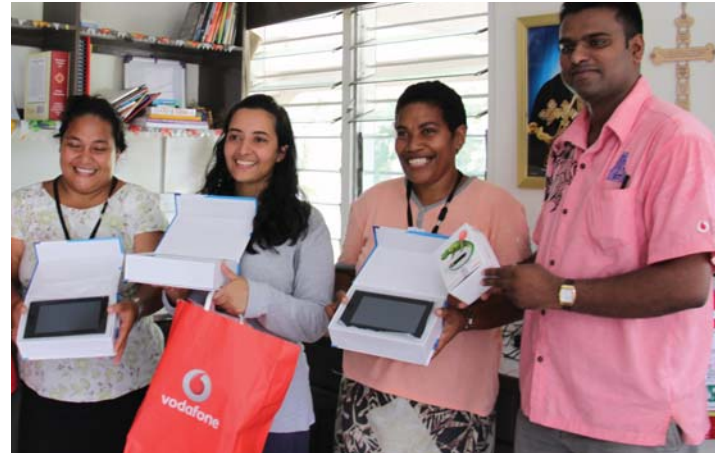
Foundation donates tablets

The Foundation's various SMS channels like mYouth, mHealth, mWomen, mSexEdu, and others are