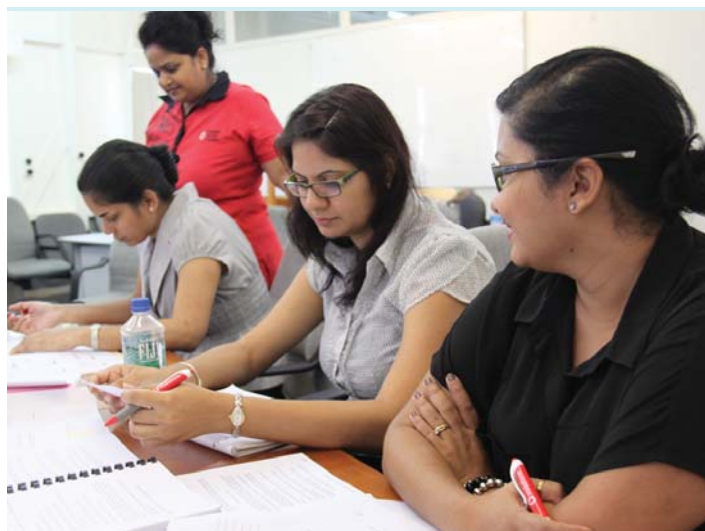
Counselors in training

"Apart from being a platform for assisting the victims and communities on addressing violence, the idea is to further expand mWomen service to promote the women in income generating skills and livelihood projects. This is particularly to complement the Ministry's vision on economically empowering the