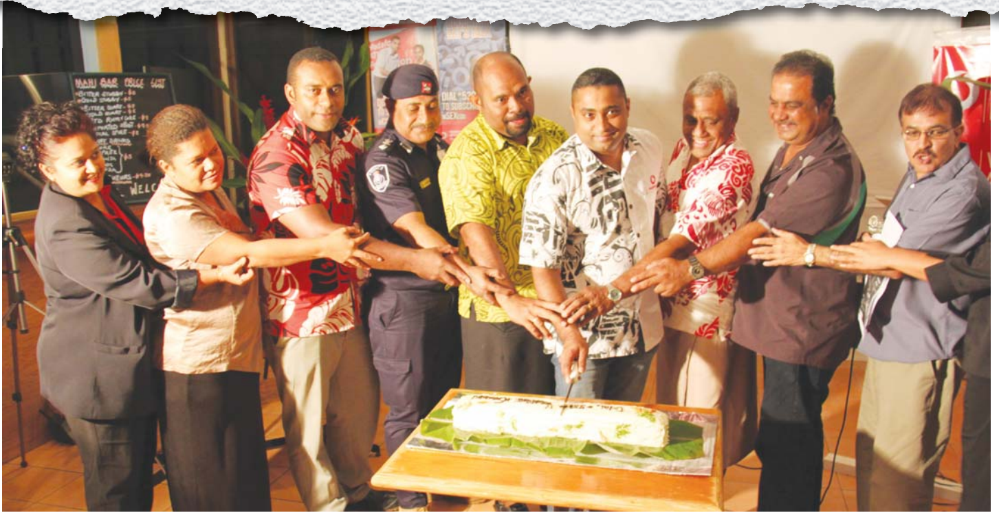
Business community and civil society representatives launch mSEXedu during the Corporate Philanthropy Seminar in Savusavu