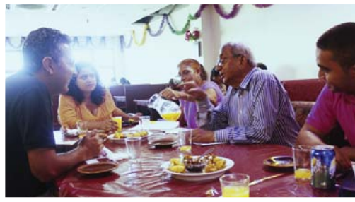
West Focus meeting with corporates

The Foundation strategy is to foster corporate giving