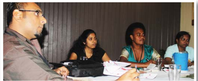
WoD western candidates

Projects range from Medical Outreach, Healing Food, Building the Communities, Basic Skill Development, Community Care, Youth Engagement, Empowering Women, Instilling Hope, Subsistence Farming, Environment Conservation, the Entrepreneurial Poor Project, Youth Peace