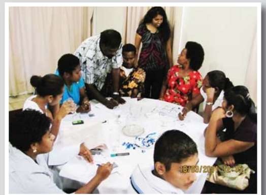
Sustaining Volunteer Projects for Greater Impact workshop in Lautoka

The project targets to supply fruits to at least 100 inpatients at the Tavua District Hospital in a few months time. This will definitely ease the burden on the hospital budget on fruit supply and would also help generate income.