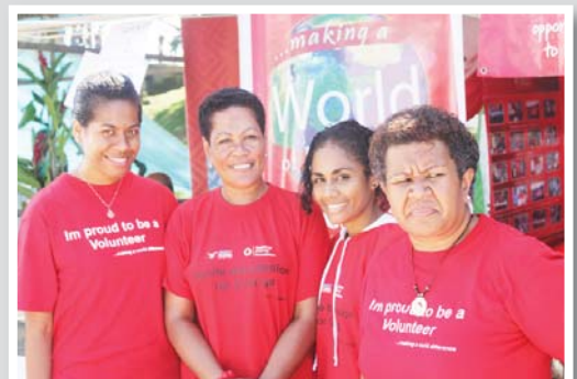
Volunteers ... ignite the passion

The NVC has engaged 1200 unemployed youths in the last 18 months and successfully empowered them, mobilized and helped them in capacity building. The programme was initially started from the Central and Western Division. These youths have been accorded the opportunity to volunteer in 49 communities in 7 districts.