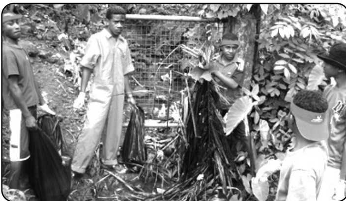
AOG students cleaning up a creek in the school compound.

Visits have already been made to teachers in secondary schools in the Suva, Navua, Nausori and Sigatoka education districts to introduce teachers to classroom activities on water education. Through the project students are given water monitoring kits and training on how to conduct field investigations on their surrounding water ways.